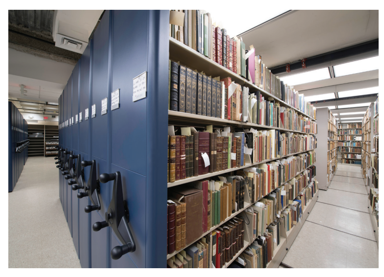
MobileTrak® system storing historical books and documents in a college library