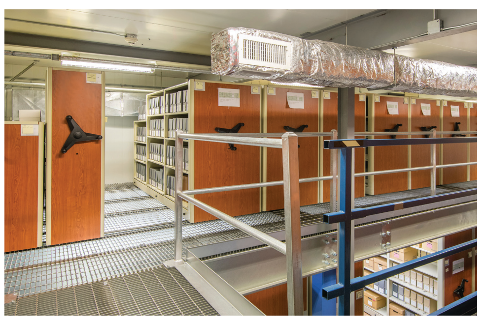
Custom-height, multi-level MobileTrak® system for archival storage in a National Park

Datum Storage Solutions® is a family-owned designer and manufacturer of quality storage solutions with over 50 years of experience in the storage equipment industry.