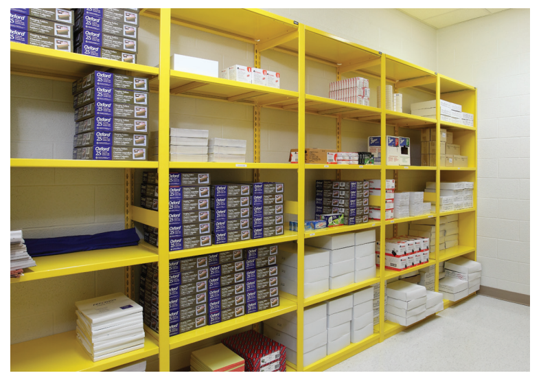
4Post™ shelving for general storage in a school