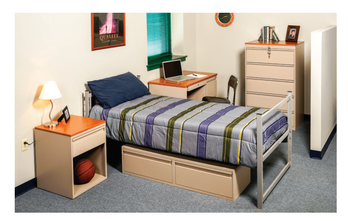
Adelphia by Datum® dormitory and institutional furnishings