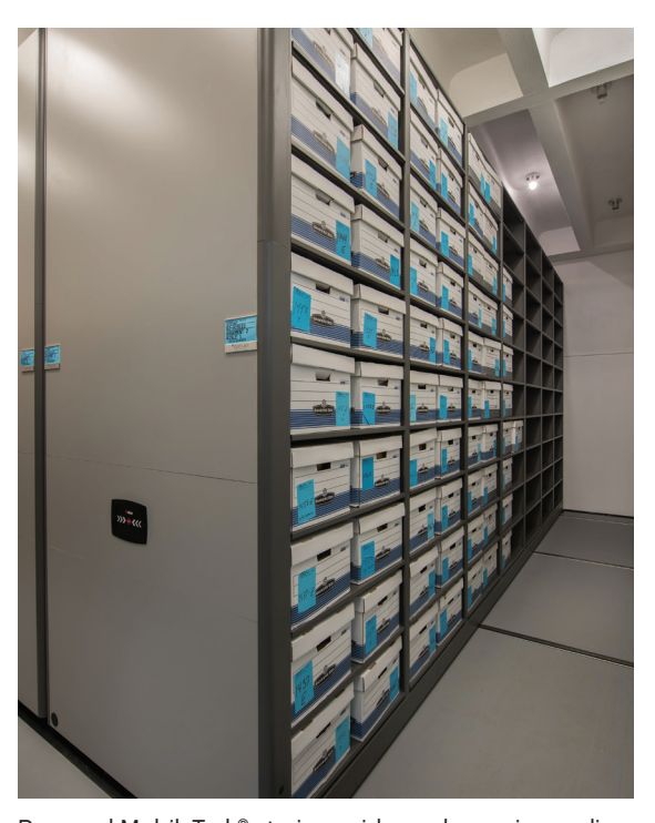
Powered MobileTrak® storing evidence boxes in a police headquarters