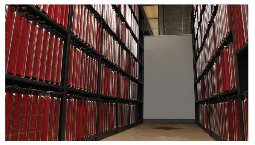
Custom 4Post™ for archival library binders