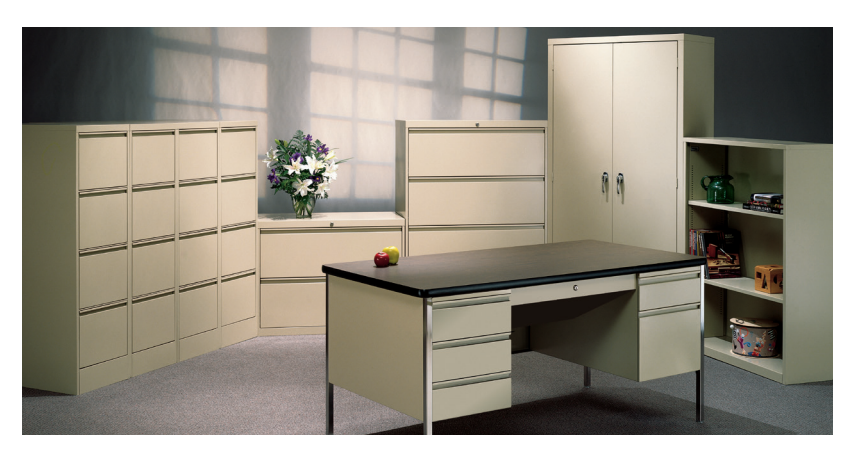
Adelphia by Datum® office furniture