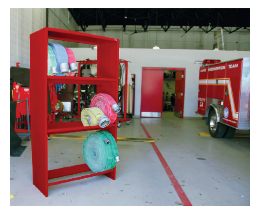
Fire hose storage using 4Post™ shelving