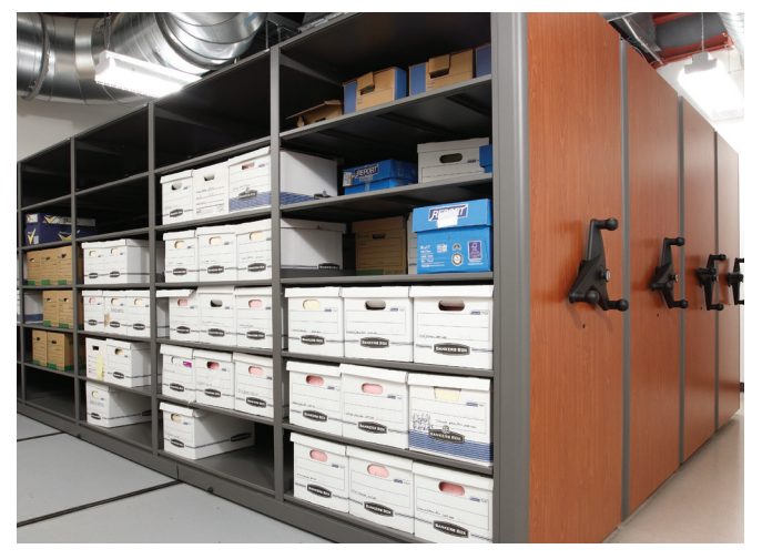
MobileTrak® storing archival boxes in an administration building