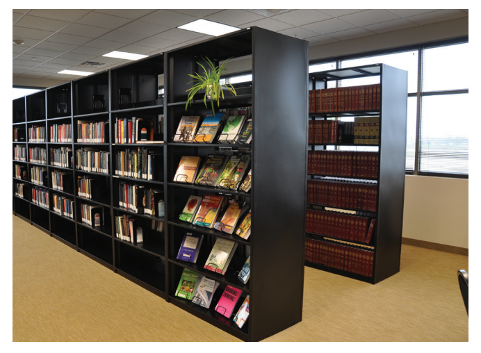
4Post™ Library Shelving housing books at a university