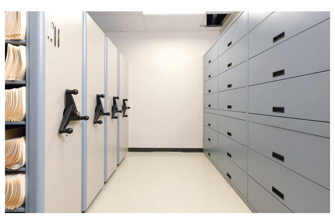
MobileTrak® and Stak-N-Lok™ modular shelving for record storage