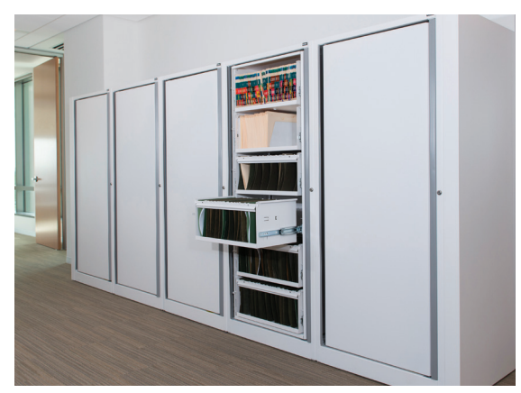
Ez2® Rotary Action File for document storage