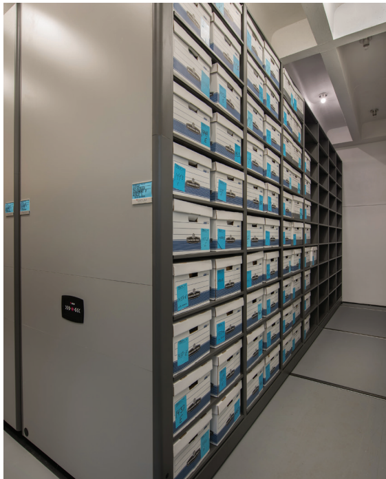
Powered MobileTrak® storing evidence boxes in a police headquarters