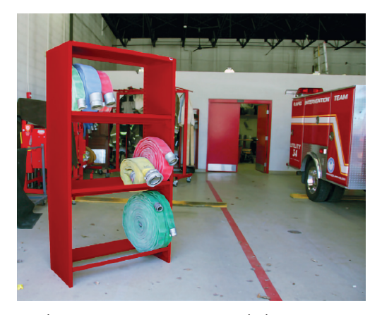
Fire hose storage using 4Post™ shelving