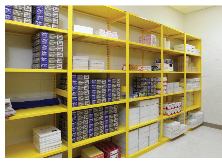
4Post™ shelving for general storage in a school