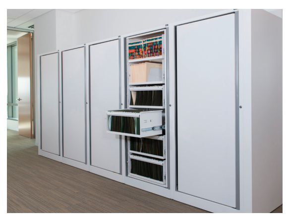
Ez2® Rotary Action File for document storage