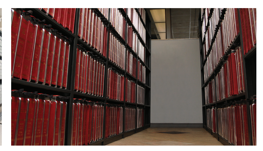
Custom 4Post<sup>™</sup> for archival library binders