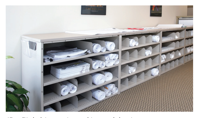
4Post<sup>™</sup> shelving storing architectural drawings