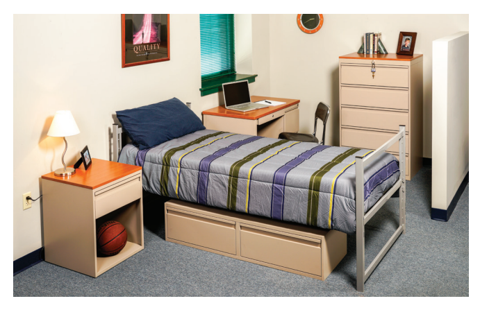
Adelphia by Datum® dormitory and institutional furnishings