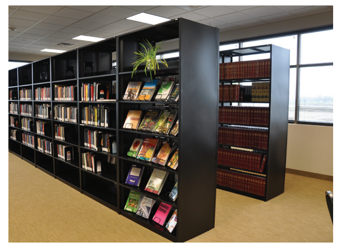
4Post<sup>™</sup> Library Shelving housing books at a university