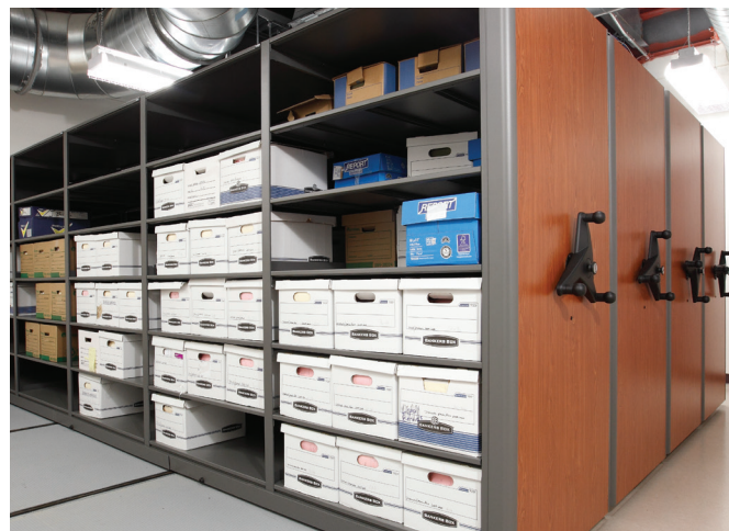
MobileTrak® storing archival boxes in an administration building