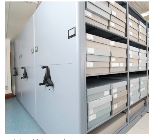
MobileTrak<sup>®</sup> System for museum storage

We design and manufacture storage solutions for virtually any application in any market, and we back up the quality of our products with the industry's leading Lifetime Warranty.