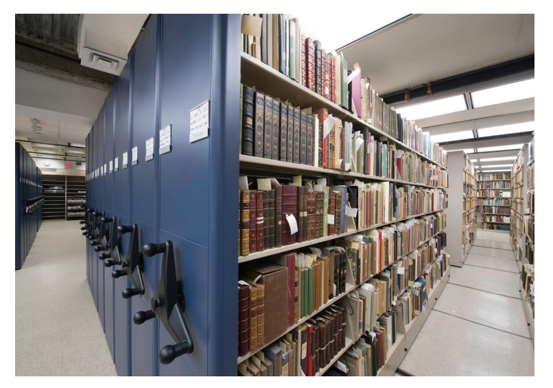
MobileTrak® system storing historical books and documents in a college library