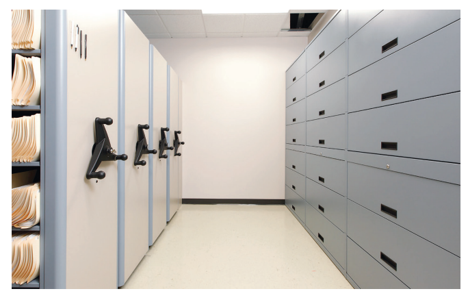
MobileTrak<sup>®</sup> and Stak-N-Lok<sup>™</sup> modular shelving for record storage