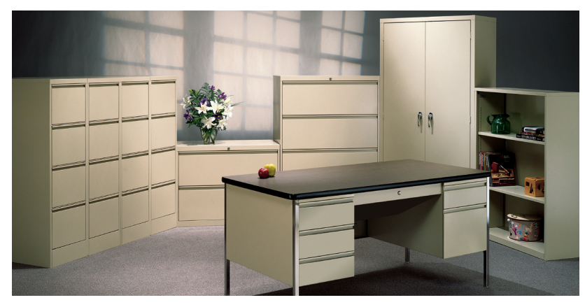
Adelphia by Datum® office furniture