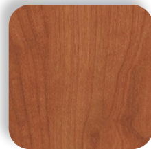
WILD CHERRY 7054-60