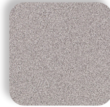
GREY NEBULA 4622-60