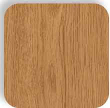
SOLAR OAK 7816-60