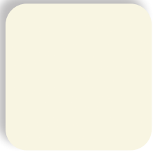
WHITE SAND D403-60

To meet a variety of functional and aesthetic needs, Datum offers 12 different high-quality melamine and laminate finishes, including solid colors, simulated wood grains, and attractive textures with matching PVC Edge. All melamine and laminate surfaces are thermally-fused for permanent adherence, and their exceptional structures resist stains, scratches, and other potential damage caused by incidental contact during routine use.