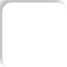
PURE WHITE T94