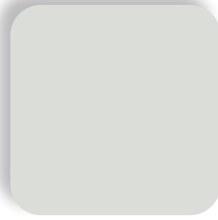
GRAY MIST T86