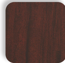
FIGURED MAHOGANY 7040K-78

Additional melamine and laminate options are available on the Wilsonart website. Please contact our Customer Service Department for pricing and lead time.