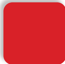
INDUSTRIAL RED T27