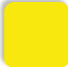
SAFETY YELLOW T93

The paint samples shown are for representation purposes only and are not a true match. Contact our Customer Service Department if actual samples are required.