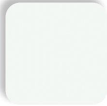
FROSTY WHITE 1573-60