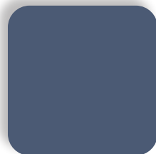
TECH BLUE T42