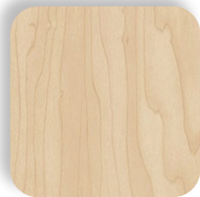
MANITOBA MAPLE 7911-60