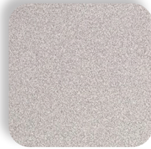
WHITE NEBULA 4621-60